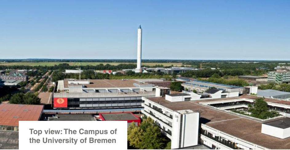
Top view: The Campus of the University of Bremen